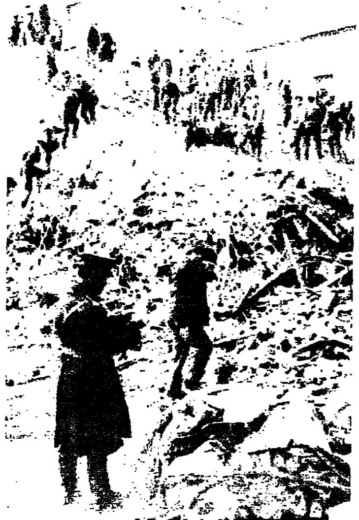
SEARCHING -- Romanian rescue workers climb up debris of collapsed house in Bucharest Thursday looking for possible survivors of last Friday's earthquake.

BUCHAREST, March 10 (R). — President Nicolae Ceausescu said today the designers and builders of some of the modern structures that collapsed in the devastating earthquake that struck Romania last Friday would be prosecuted.